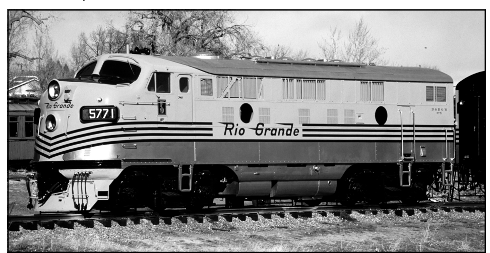
Restored Denver & Rio Grande F-9A #5771 on 1/26/99.

had the honor of cutting the cake at the 25th Anniversary celebration of the start of the Zephyr.