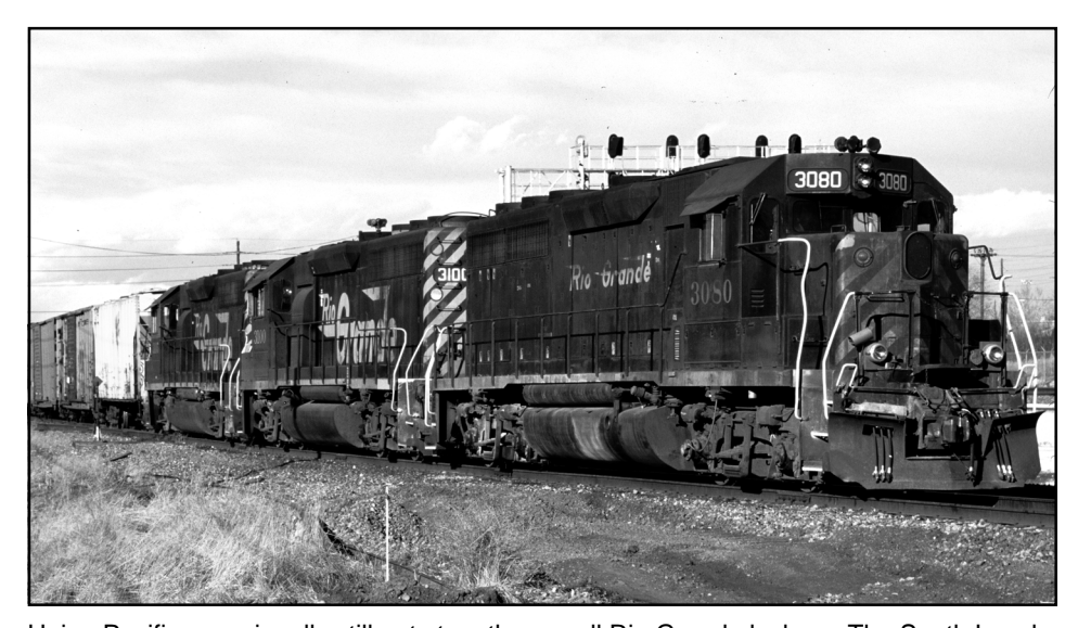
Union Pacific occasionally still puts together an all Rio Grande lashup. The South Local had Denver & Rio Grande Western GP-40 #3080, GP40-2 #3100 and 3105. The crew had gone dead on the law, and the train was lying over during the day at Littleton, CO, along the Joint Line on 2/17/99.

Union Pacific returned all of the SD90MAC-H (UP #8501-8511) to EMD during 12/98. Units were still out of service at the end of 2/99. UP has requested that EMD supply them with ten protection units much as did GE when the C60AC were having prime mover problems i.e. GECX 4000-4009 now UP 7000-7009. These units should be coming on line about the end of 3/99 as EMDL (EMDL-P) units, number series 7100-7109. – Don Z